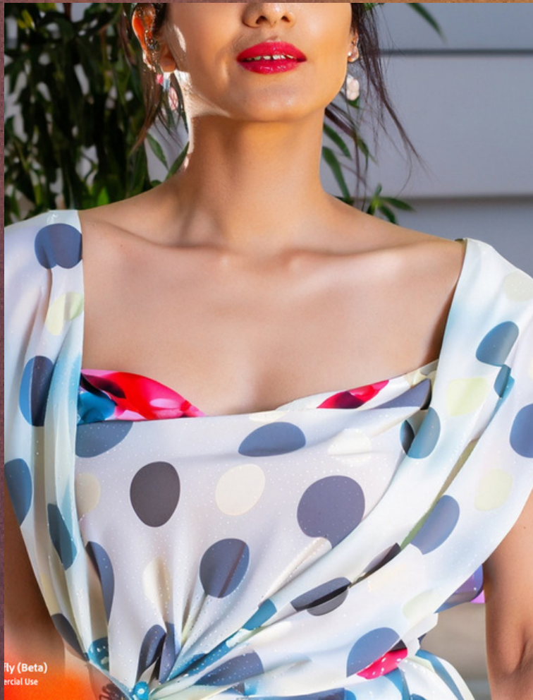
Adobe Firefly (Beta) Not for Commercial Use