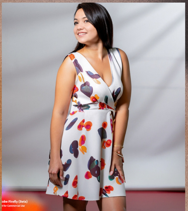
Adobe Firefly (Beta) Not for Commercial Use